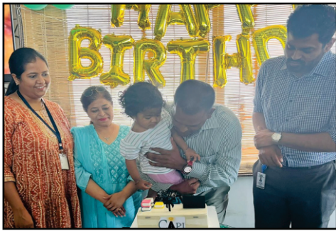
Birthday celebration of MD Sir