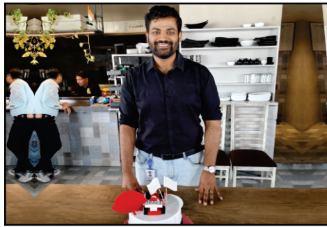
Birthday celebration of Director Sir